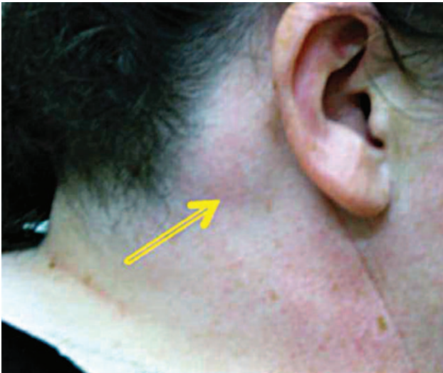
Fig. 1. Retroauricular lipoma.

a retroauricular lipoma (Fig. 1). She reported pain and limited sleep, because of the inability to rest her head on the pillow. Clinically, the lipoma was hard, fibrotic, and 35.8-mm thick, as confirmed by ultrasound (Fig. 3A).