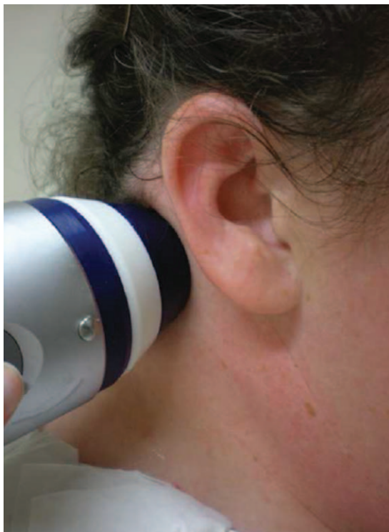
Fig. 2. Treatment with defocused EAWT.

After informed consent, the lipoma was treated with EAWT (Cellactor SC1, Storz Medical, Switzerland) applying only the defocused planar handpiece once a week, for a total of 8 sessions (Fig. 2). The energy range was 0.09–0.27 mJ/mm 2 , with a conse-